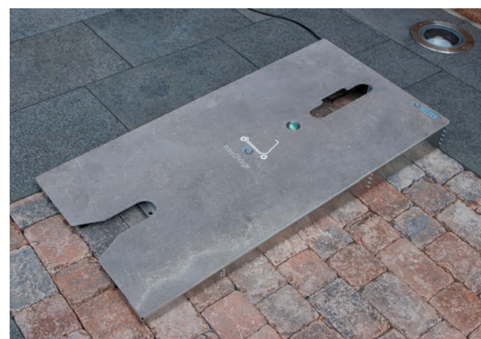
Platform in porcelain stoneware material on stainless steel frame

INTIS easyCharge - enabling electric and shared micro mobility to be more convenient, more environmentally friendly and more cost effective.