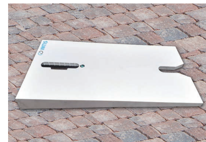
Platform in GRP GiRo material with stainless steel panels